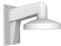
DS-1473ZJ-155 Wall Mount